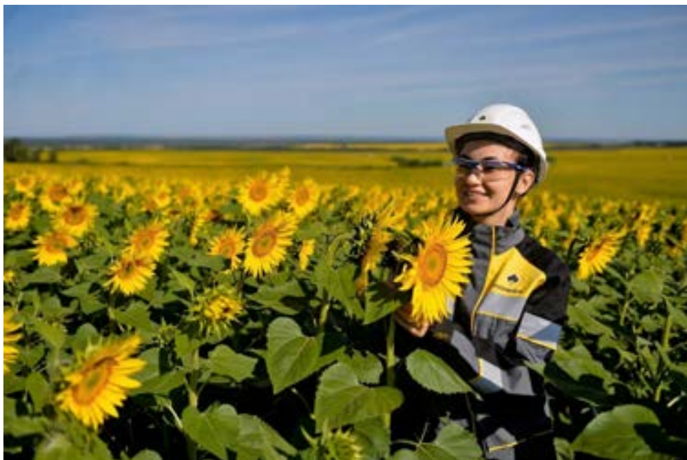
Preserving the environment for future generations

In 2018–2022, our “green” investments will total RUB 300 bln.