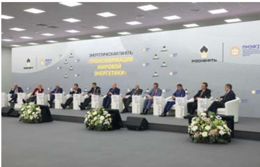
Igor Sechin, Chief Executive Officer of Rosneft, made a key presentation at the Energy Panel "Transformation of the World Energy", held within the framework of the XXIV St. Petersburg International Economic Forum.

The Company acknowledges the importance of sustainable development of the global energy sector and responsible behavior of key producers, including sufficient investment volumes to replenish the resource base, timely and efficient development of reserves and ensuring reliable supplies to consumers from developed and developing countries. Given modern challenges, it is unacceptable to create obstacles to the participation of producers in the global oil and gas market and barriers to investment in energy efficient projects.